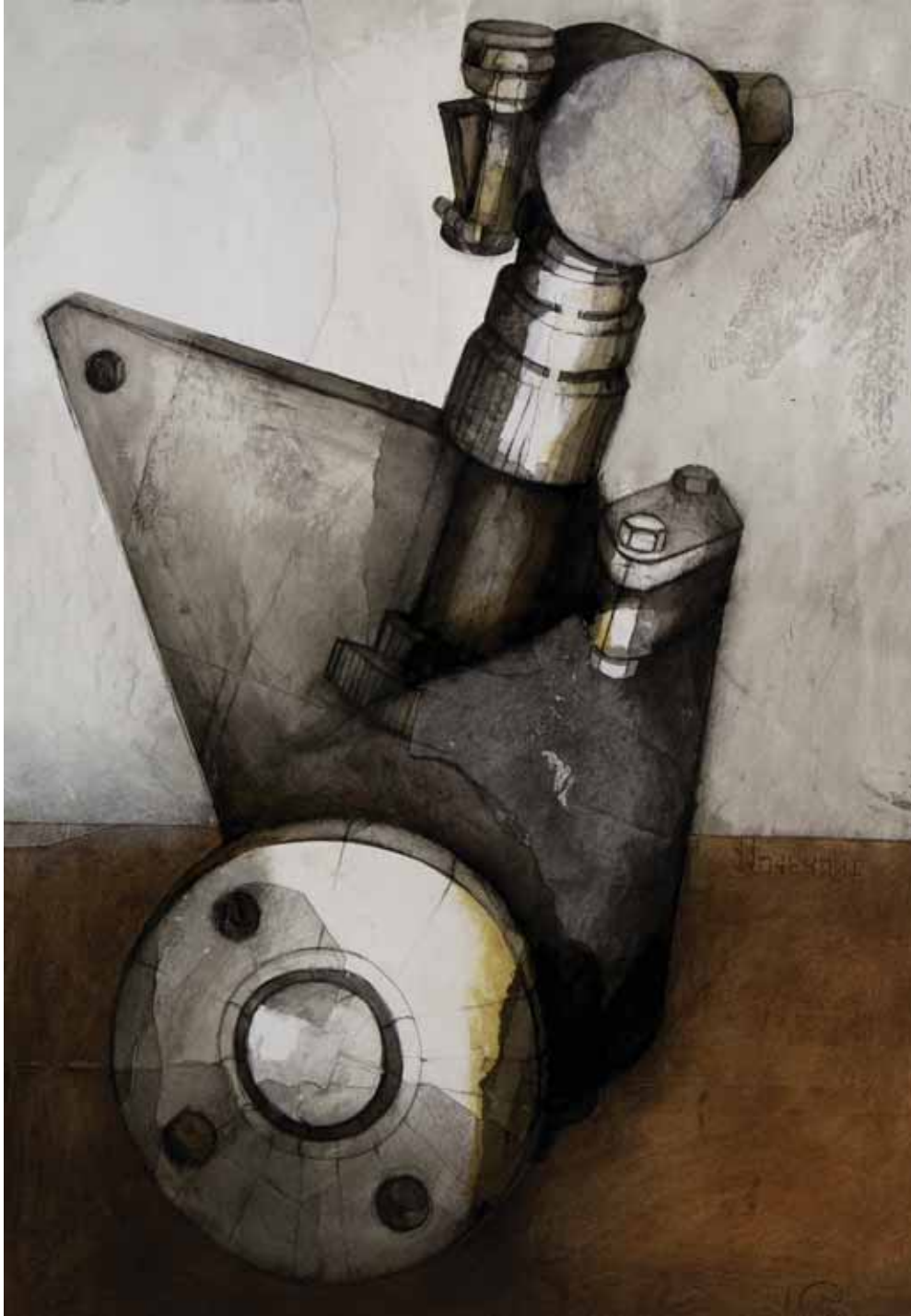
RAIDER Mixed Media on Paper 80x56cm