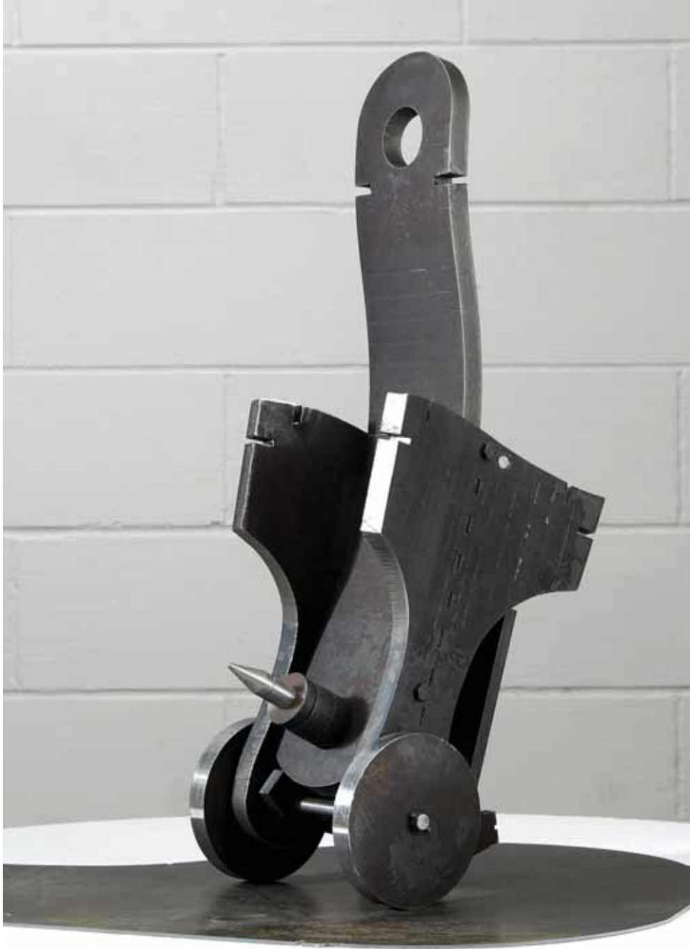
NAVIGATOR Corten Steel Height 71cm