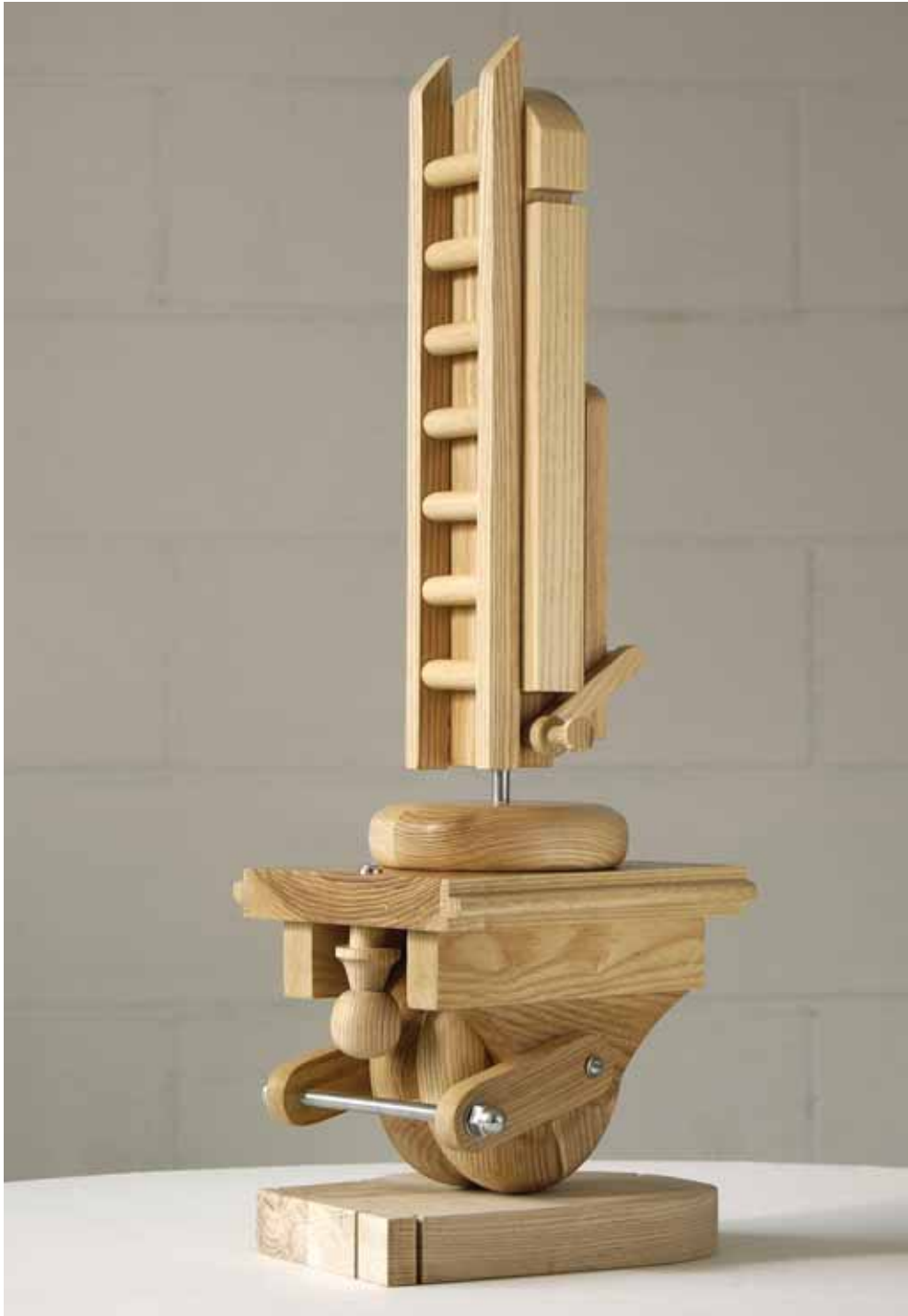
PORTRAIT OF DAL FABBRO (back view)