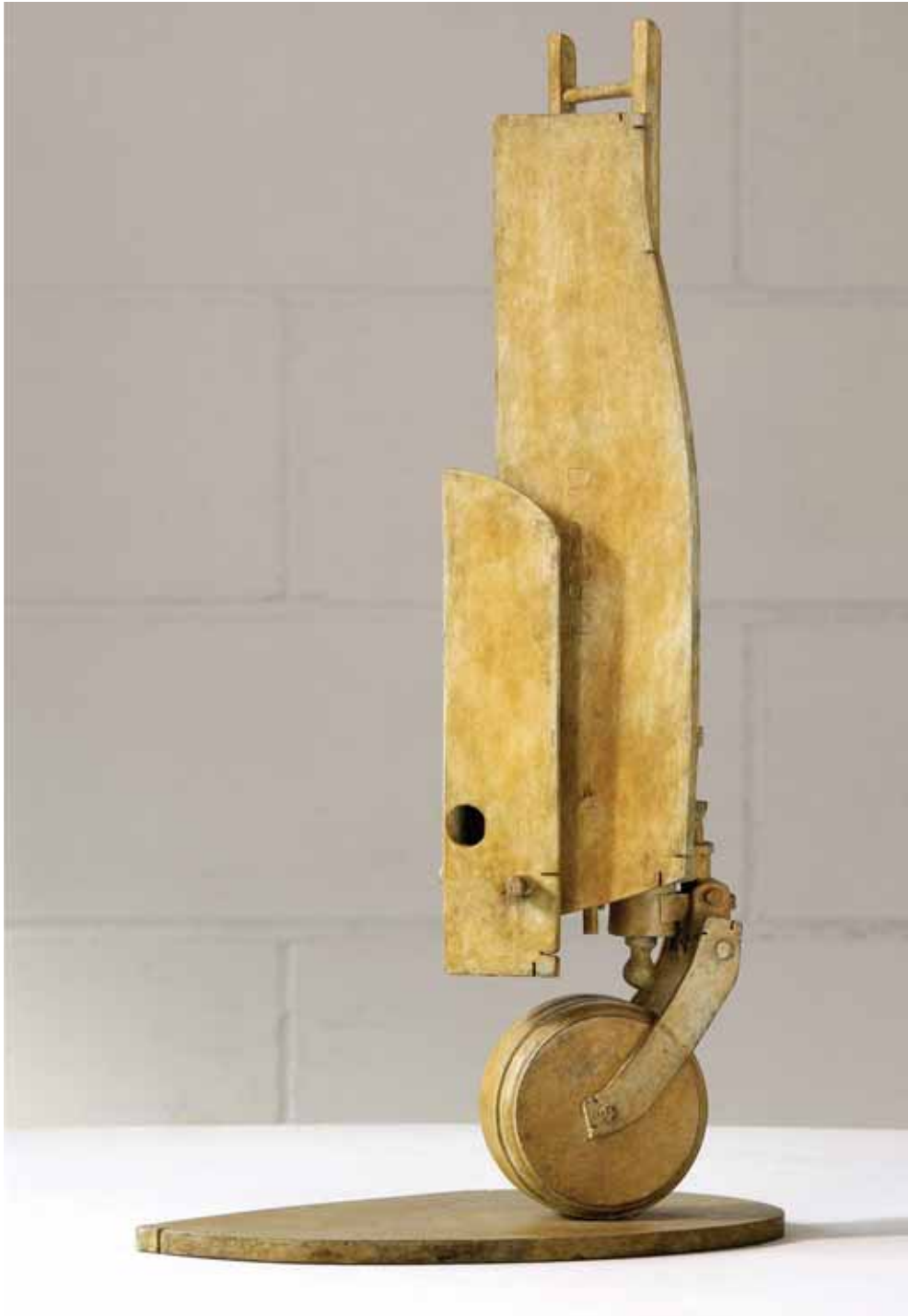
LOOKOUT (front view) Bronze Height 50cm