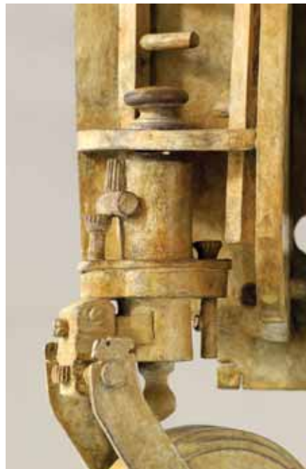
detail of LOOKOUT