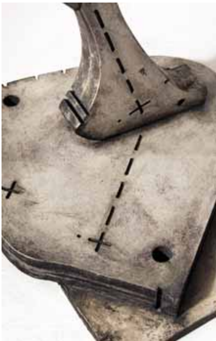
detail of SIGNALLER I