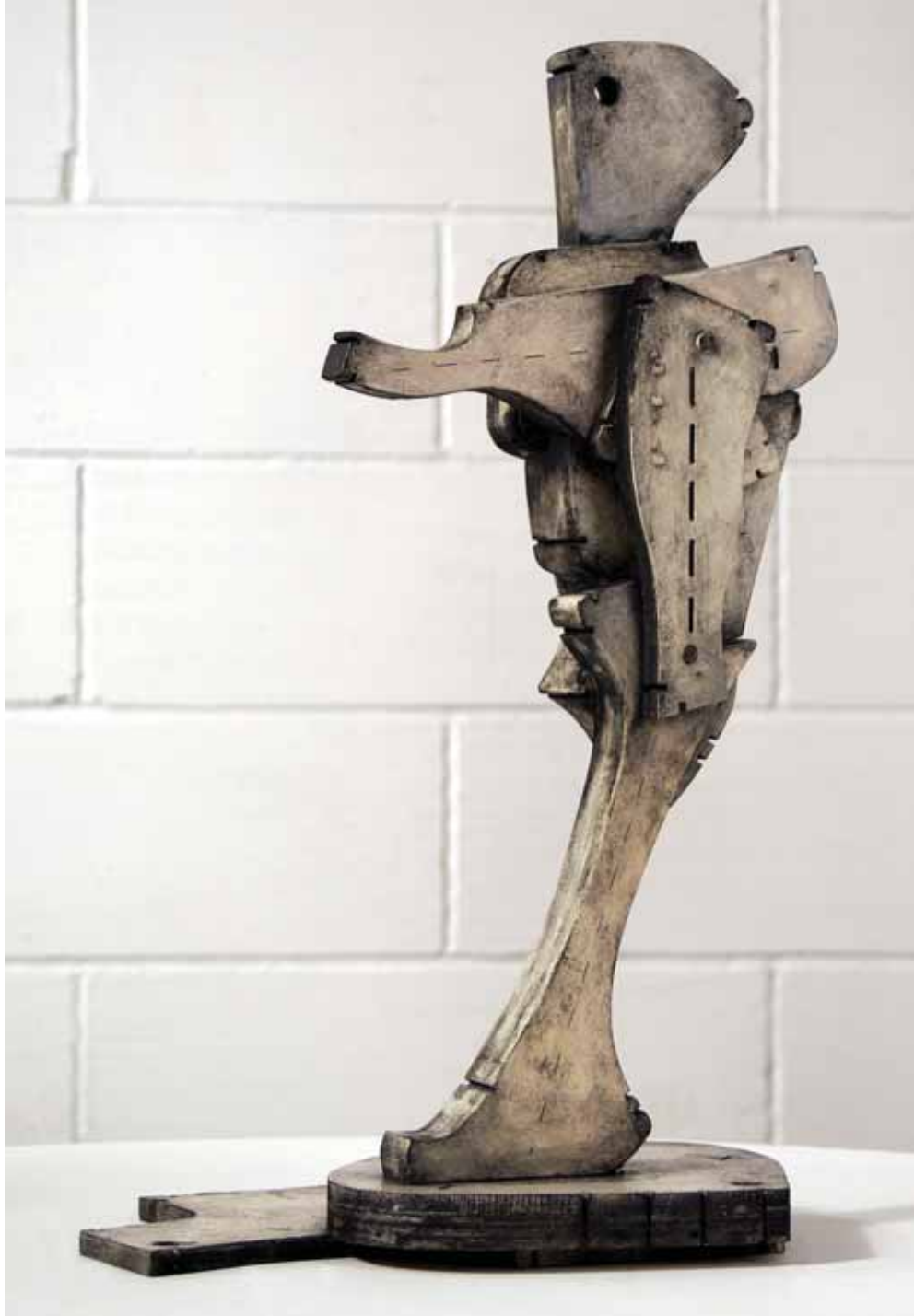
THE SIGNALLER (rear view) Painted Wood Height 67cm