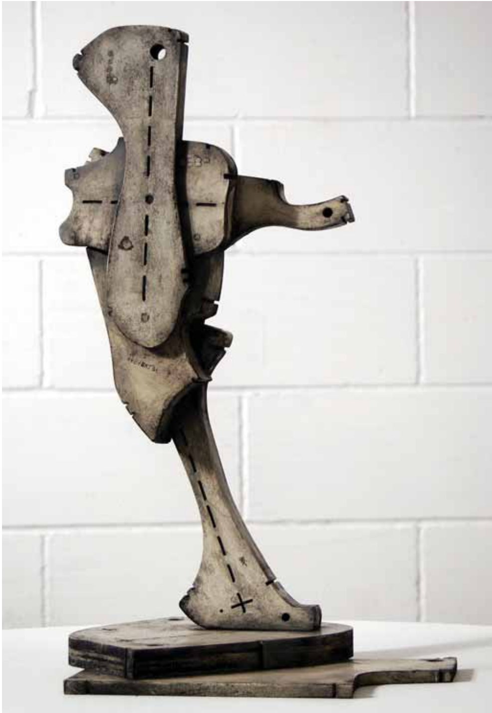
THE SIGNALLER (front view) Painted Wood Height 67cm