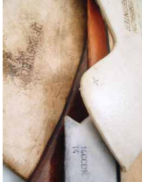
BOLLIHOPE SHIELD Mixed Media on six suspended and upholstered wood templates

eccentric and unstable. Even the articulations of hole and notches are oddly reassuring and familiar, although one is not quite sure why at first. These rather minor details are one key to how Atkin structures sculptural form, making sure that the smooth graceful curves do not become too abstract, but retain echoes of the everyday. Additionally, these articulations provide a sense of both purpose and incompleteness. Do other parts fit here? Are we waiting for them to be returned? Were they removed because unnecessary? Are we looking at the chassis (stand-in for the unadorned human body)? Or are we looking at the crucial aiming device or tongue to be fitted onto another chassis to guide it? Through the formal and narrative questions that Atkin raises here, we are pulled away a bit from Batman or Grimm's Tales, and brought into the orbit of the literature of writers like Samuel Beckett, Edward Bond and Maurice Blanchot. The menaces felt to be external - threat from that beyond one's control - and the menaces felt to be internal: anxiety, impotence, misunderstanding, and failure - perhaps beneath one's control - are related by Atkin, in a subtle understated manner