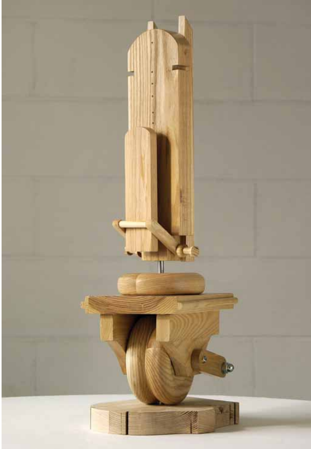
PORTRAIT OF DAL FABBRO (front view)