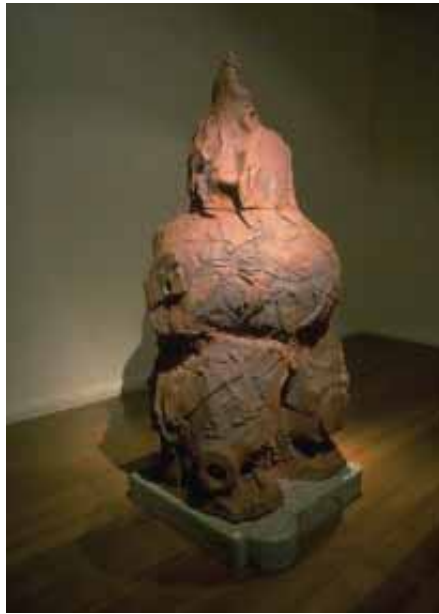
HOSTAGE 1990 Ceramic and found objects Height 180cm

The sculptures and drawings of John Atkin present not so much images of machines as they do diagrams of machines incompletely realized in our imagination. His playful inventions are casual and direct statements. And yet, like a well-written Tokugawa haiku - as opposed to a poorly written Elizabethan sonnet - they are metaphoric and rhetorical in the sense that they help us to discover our own metaphors in them, rather than impress us with the cleverness of the packaged rhetoric of their creator. They are not just literal observations, nor are they surrealistic details from one man's psyche, but more than anything else, they are complex metaphors simply put. Classical haiku frequently create parallels between states of nature and states of the human mind and human condition. Atkin's works explore how the human mind and the human condition are mirrored in the tools and devices that people make. And through this process these tools and machines are transformed into symbols and characters in the dramas of human experience.