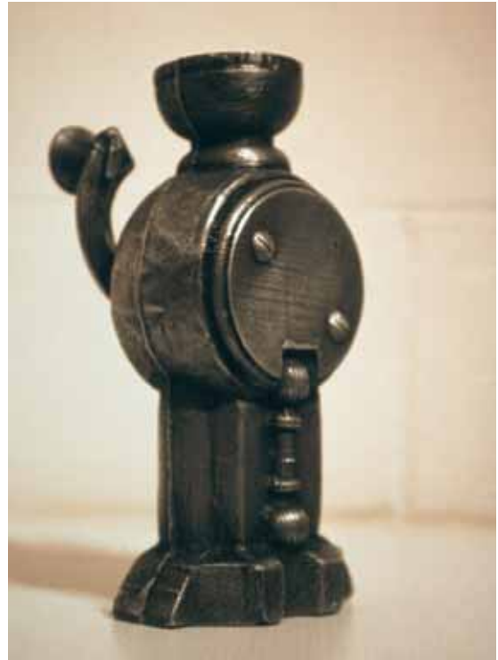
HUNTER AND TRAP 2002 Cast Aluminium 23 x 13 x 12cm REIVERS Works on Paper and Sculptures Kouros Gallery, New York 2002

While these works have their playful aspects, all this is not without attendant threats and dangers - just as in children's imaginations there are areas of real fright, even though provoked by what we sometimes call fiction. (Of course to call it fiction we have to show disrespect and misunderstanding for the real nature of these perceptions.) The Navigator series is only tinged with that sense of cartoonish menace found in other recent works such as Hunter and Trap and Sentinel . The sculptures in Atkin's recent