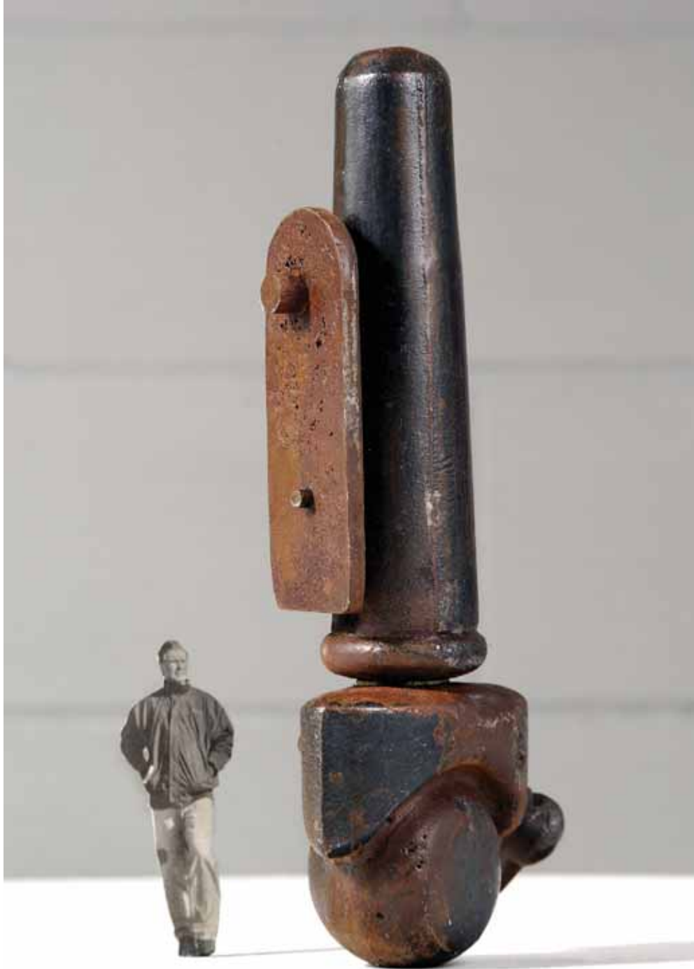
SENTINEL Cast Iron Height 33cm