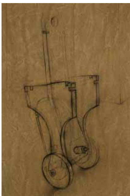
FLEEING FIGURE Mixed media on Ceramic Grog 82 x 53cm

Similar elements and events occur in the sculptures. While the interruption of one form overlapping another that occurs in the wall-hung pieces is not literally present in the sculptures, one feels the particular interruptions and exchanges between the shapes of The Navigator , with each other and with the surrounding space, as events related to those of the wall-hung series. The arc or bend of each edge and shape is responding. To what? To a missing piece? To the space needed for an arm or wheel to rotate? To a means of designing the element to have