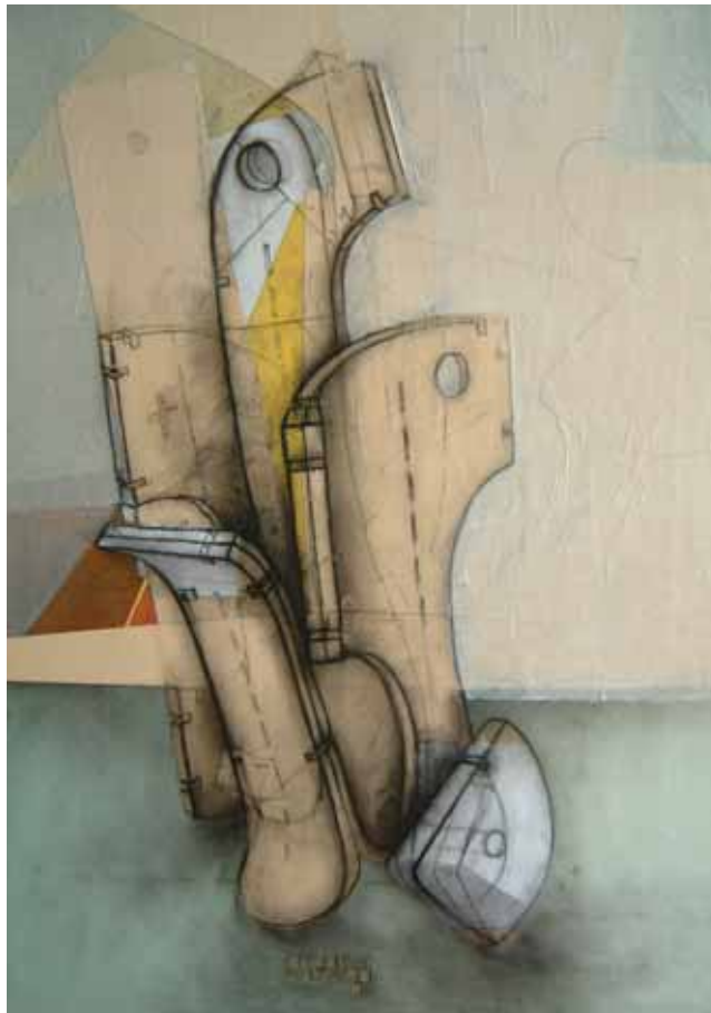
FLEEING FIGURE Collage, Mixed Media on Paper 80 x 51cm

We have fallen in the dreams the ever living Breathe on the tarnished mirror of the world, And then smooth out with ivory hands and sigh. W.B. Yeats