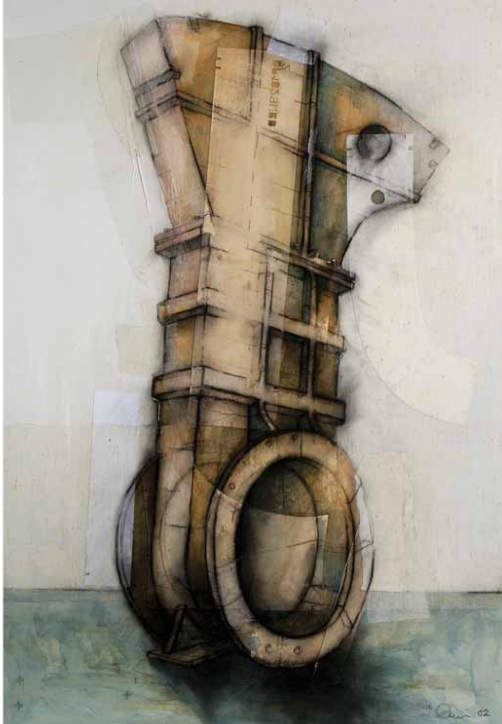
WANDERER II Mixed Media and Collage on Paper 87x56cm