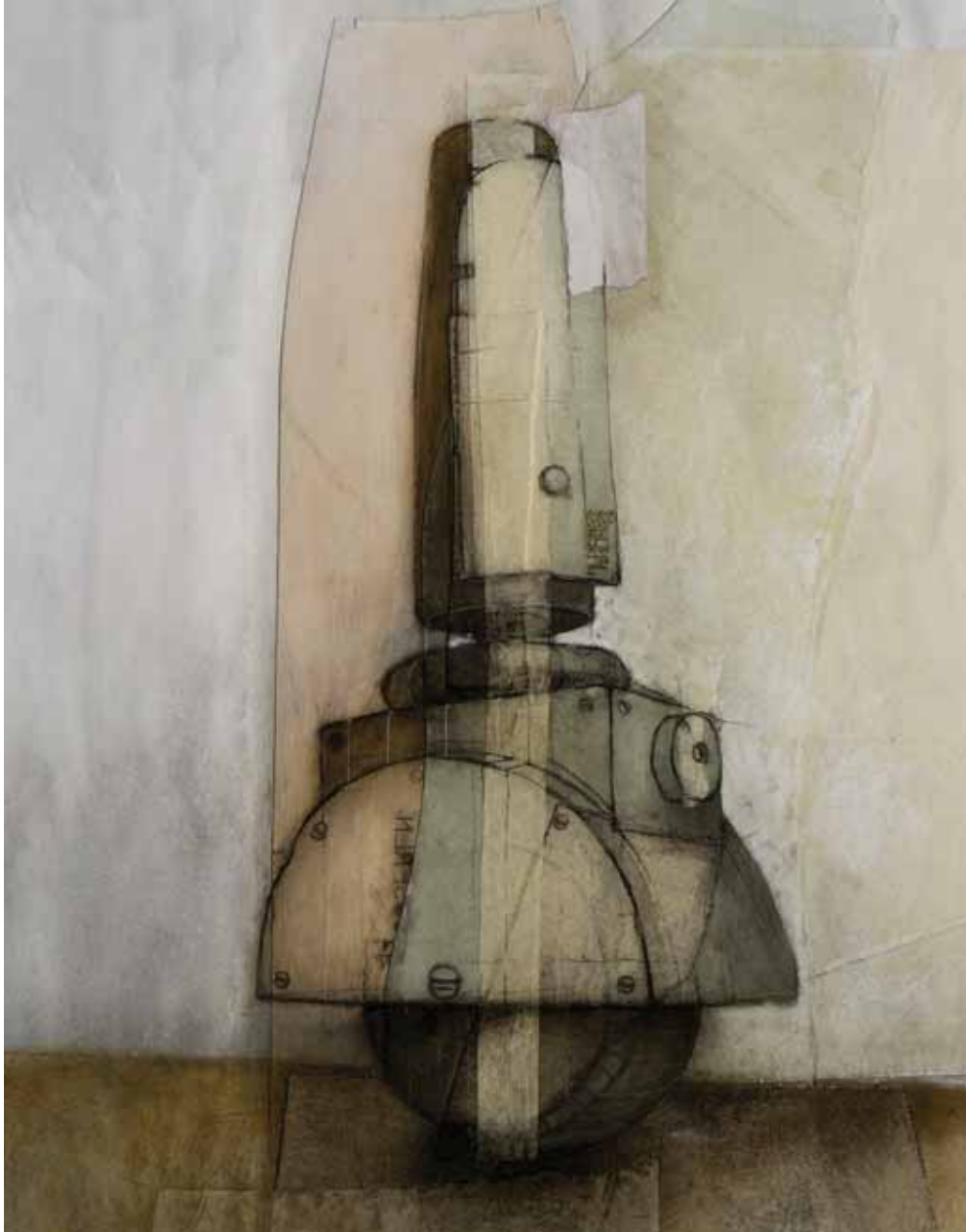
BORDER RAIDER Mixed Media on Paper 83x51cm