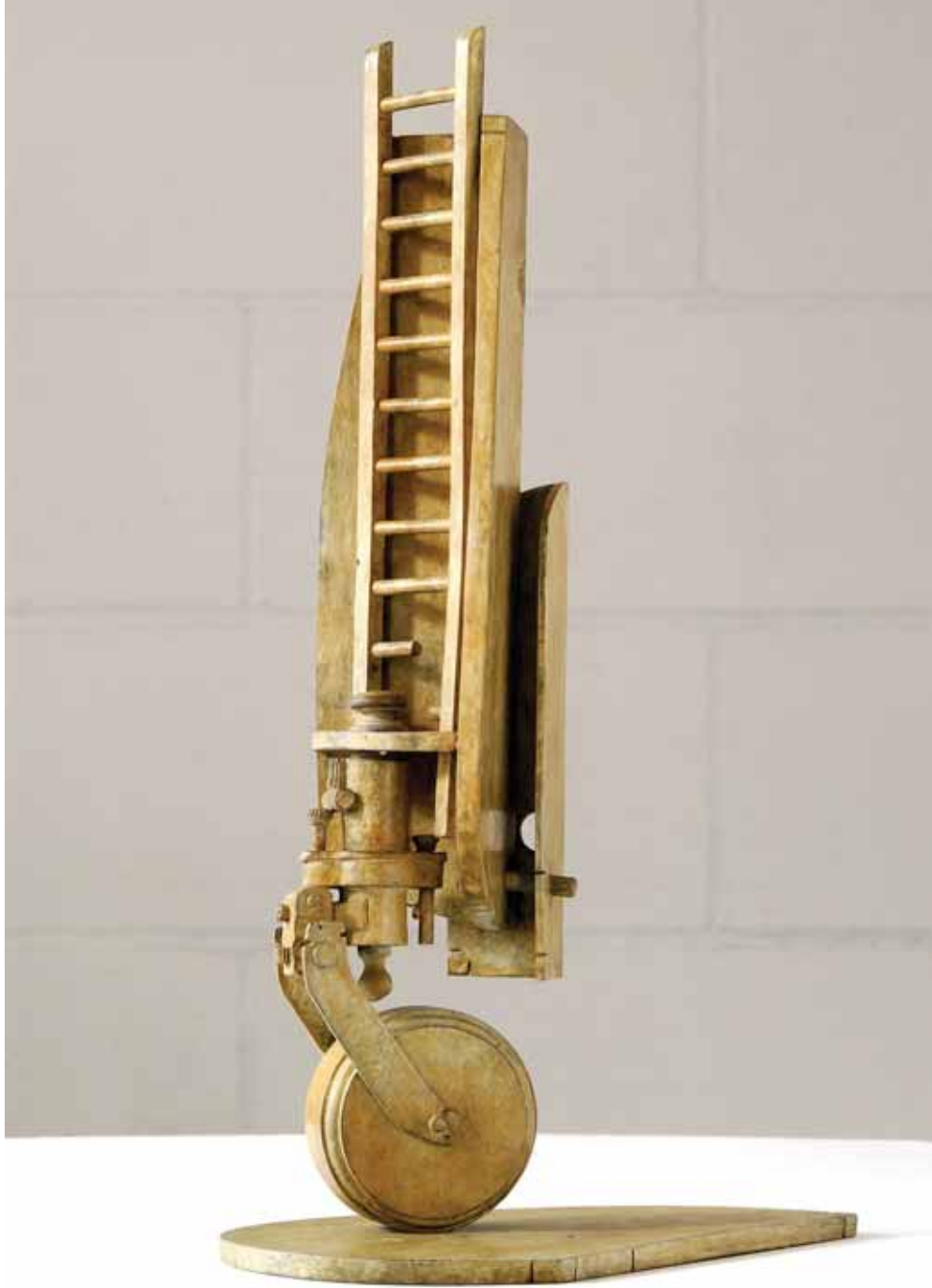
LOOKOUT (back view) Bronze Height 50cm